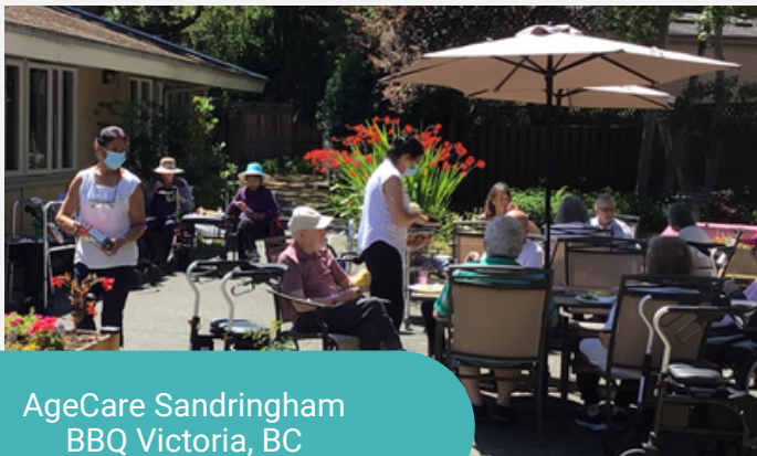
AgeCare Sandringham BBQ Victoria, BC