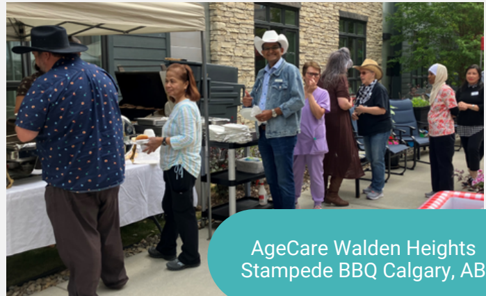
AgeCare Walden Heights Stampede BBQ Calgary, AB